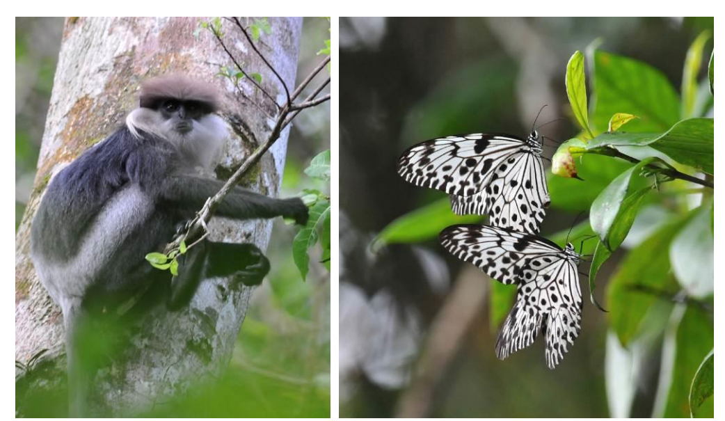
Purple faced Leaf Monkey and Sri Lanka Tree Nymph Butterfly

Accommodation – Leisure Village, Nuwara Eliya