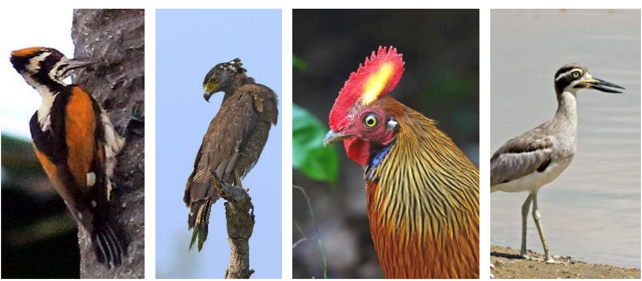
White naped Woodpecker / Crested Serpent Eagle / Sri Lanka Jungle Fowl / Greater Thicknee