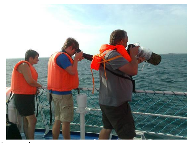
Whale watching in south coast

Accommodation - Paradise Beach Resort, Mirissa or Insight Beach Resort, Ahangama