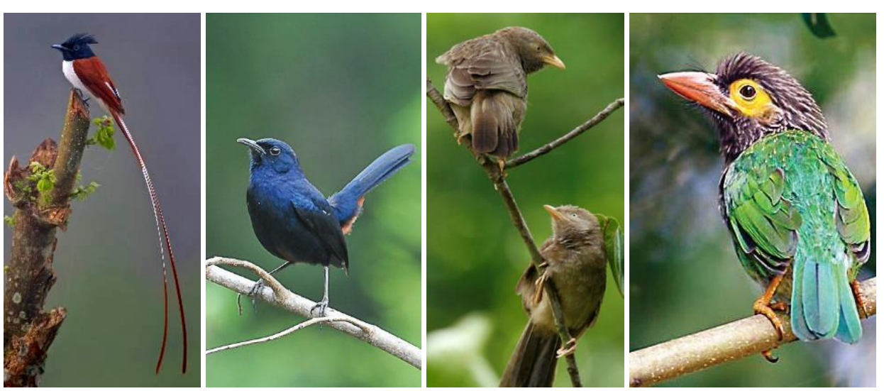
Photo - Paradise Flycatcher / Indian Black Robin / Yellow billed Babbler / Brown headed Barbet