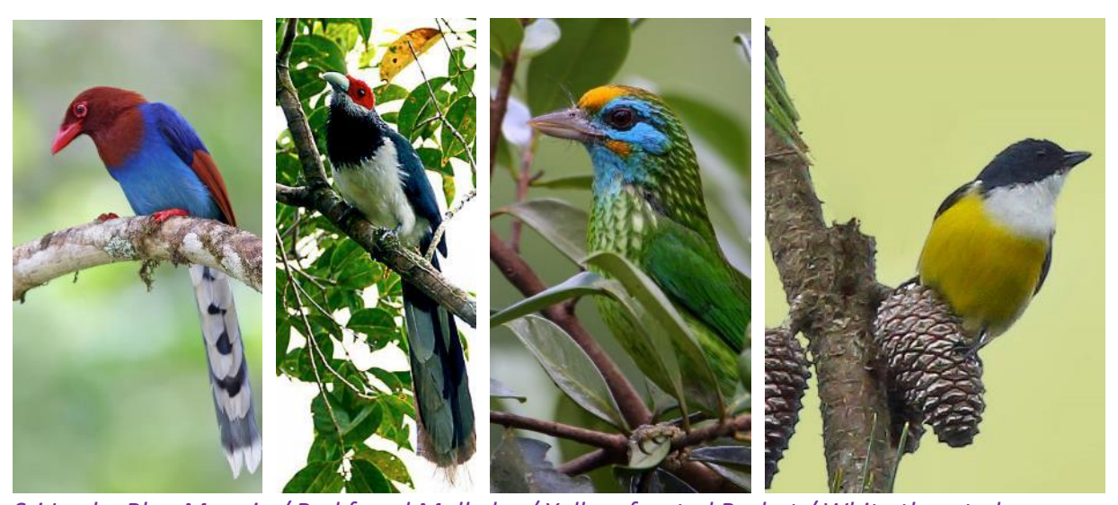
Sri Lanka Blue Magpie / Red faced Malkoha / Yellow fronted Barbet / White throated Flowerpecker

Accommodation – Blue Magpie Lodge, Sinharaja village