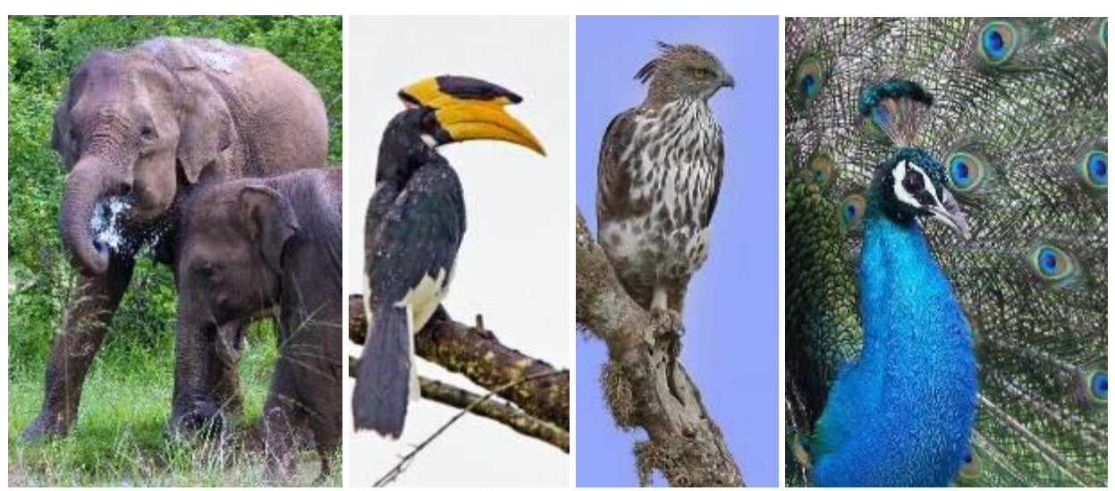
Elephant / Malabar Pied Hornbill / Crested Hawk Eagle / Indian Pea Fowl

Mugger Crocodiles frequent the river banks and, as we explore through the southern sector of the park, we'll find plenty of Tufted Grey Langurs as we watch eagerly for mammals such as Sambar and Spotted Deer. Leopards are probably easier to see here than anywhere else in Asia, and Yala is world famous for its large population of this most beautiful 'big cat'. With luck, we should have at least one encounter during our stay here. Sloth Bear is also common in the park, but less easily seen.