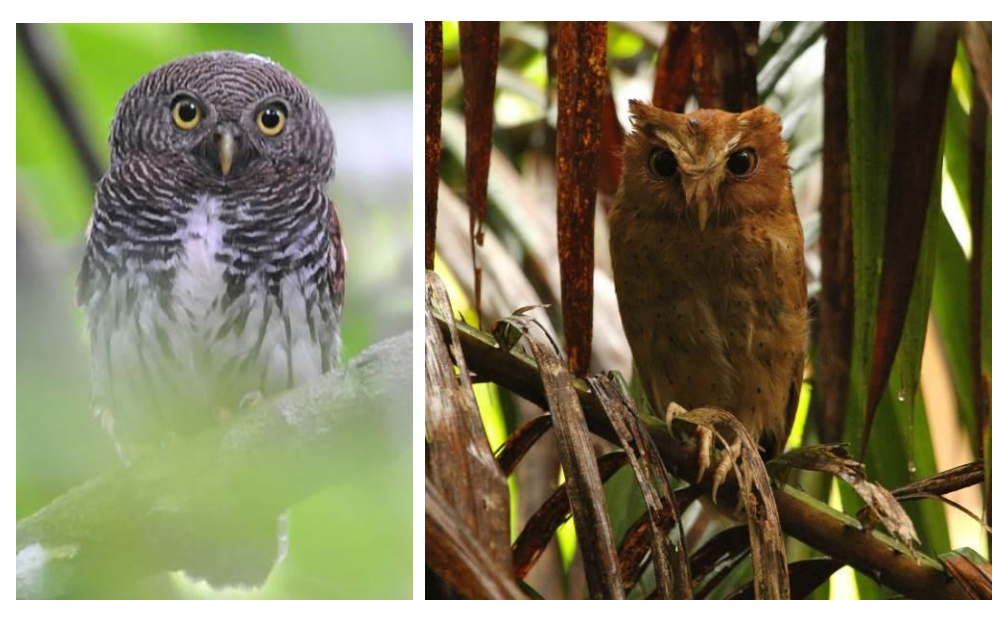
Chestnut Backed Owlet and Serendib Scopes Owl

After breakfast, if river levels permit, we may be ferried across the river by dug-out canoe or walk through a hanging bridge to explore Kitulgala's quiet forest trails, which are home to such exciting endemics as the tiny Sri Lankan Hanging Parrot, Yellow-fronted Barbet, Orange-billed Babbler and Sri Lankan Grey Hornbill. As well as these unique Sri Lankan residents, the area is rich in other bird life with the shy (but noisy!) Black Bulbuls, Black rumped Falme back Woodpecker, Crested Goshawk and Crested Treeswifts to watch for as Indian Swiftlets swirl overhead.