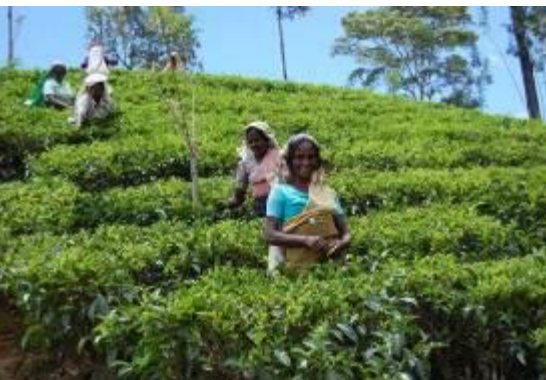
Ceylon tea in highlands of Sri Lanka