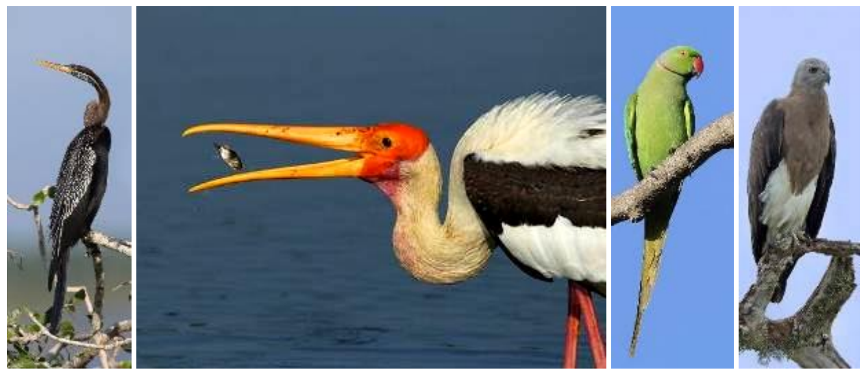
Indian Darter / Painted Stork / Rose ringed Parakeet / Grey headed Fish Eagle